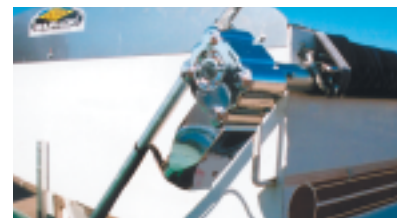
Top to bottom: Shur-Lok® roll tarp on spreader; stainless steel retainer, standoff and end cap; and electric motor.